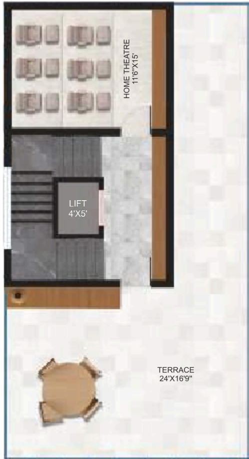
PENT HOUSE PLAN