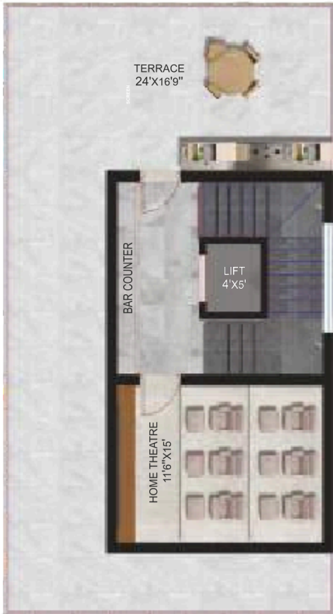
PENT HOUSE PLAN