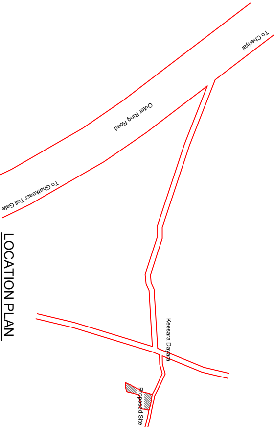
LOCATION PLAN NOT TO SCALE